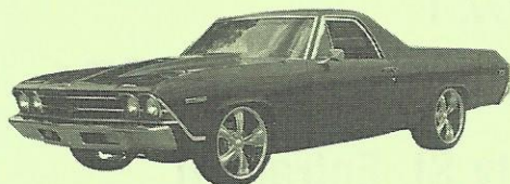
Rebel Smith's 1969 El Camino Chevy